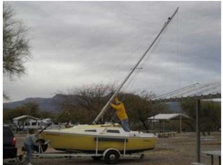
Roosevelt Rendezvous—Stepping the mast preparing for a cruise on Roosevelt Lake (above) and P/C Rob Anderson and Joe Warren apparently already enjoying one.

The Windy Hill Campground can be reached from the north via State Route 87. Turn south on 188 and drive approximately 40 miles. Access is also from the Globe /Miami area. Go north on State Route 88 approximately 25 miles.