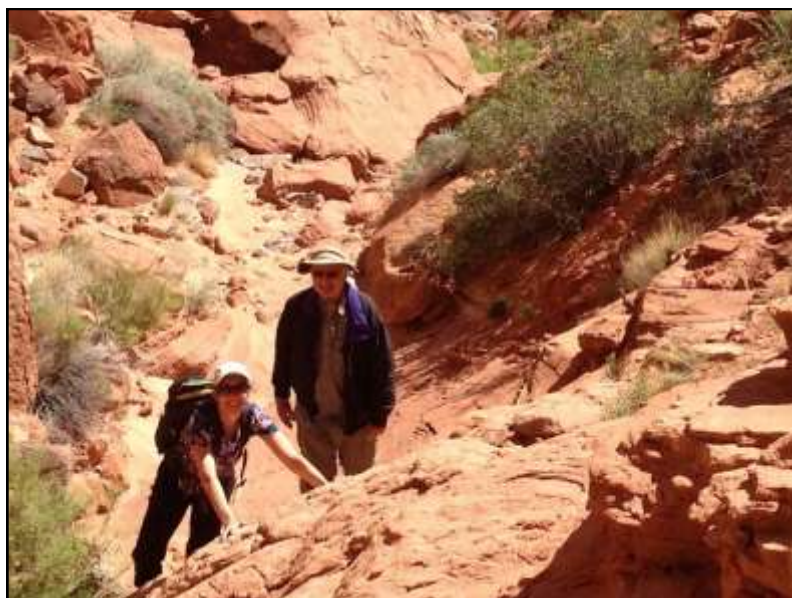
Lake Powell Photos —Members of the party that visited Lake Powell in the Rendezvous organized by Art Ashton explore some of the more picturesque areas of the massive lake. Apparently, from the perspective these photos, the weather could not have been nicer. More photos on the next page.