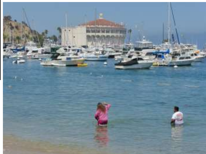
Avalon Harbor —The iconic Casino in Avalon Harbor is the landmark that many seek on weekends on Santa Catalina Island.

Emerald Bay is a lovely place with about 100 mooring balls, administered by the Two Harbors crew, and only a few miles from Two Harbors.