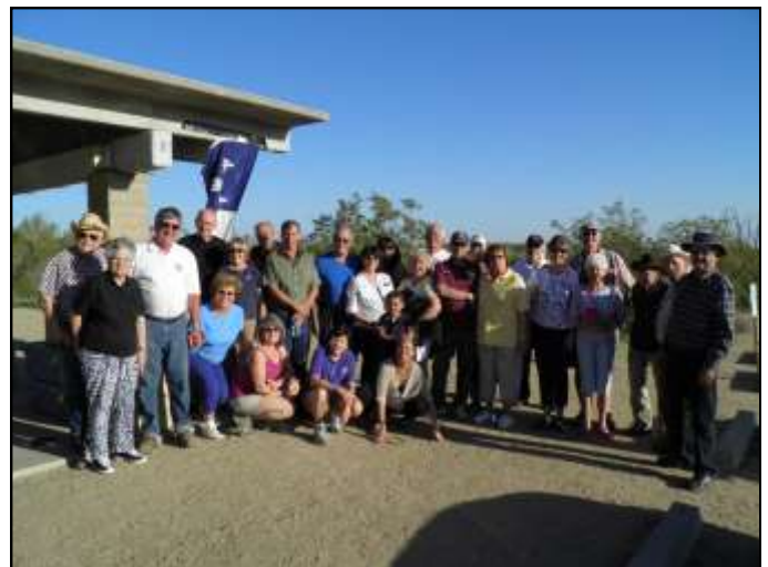
Everyone —The entire collection of cooks and participants posed for this picture. (more pictures on page 7)