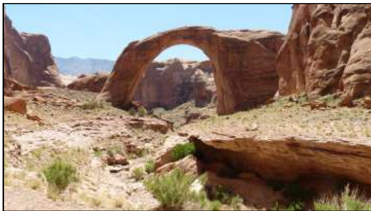
Rainbow Bridge —One of the most beautiful subjects at Lake Powell is Rainbow Bridge, the tallest of its kind .