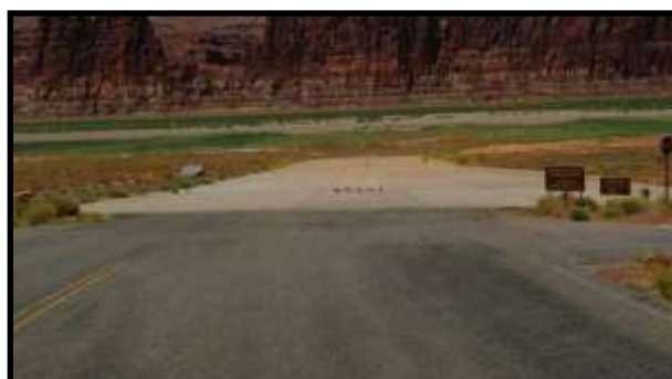
Hite Marina launch ramp is high and dry.

of inexperienced boaters showed up. We could have conducted a basic boating safety class on the water. We can confirm At there is still a need for boating education. At the end of the day everyone was tired and happy and looking forward to the next boating adventure.