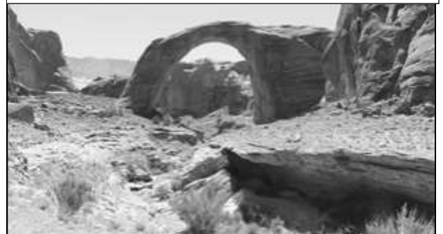
Rainbow Bridge —One of the most beautiful subjects at Lake Powell is Rainbow Bridge, the tallest of its kind .