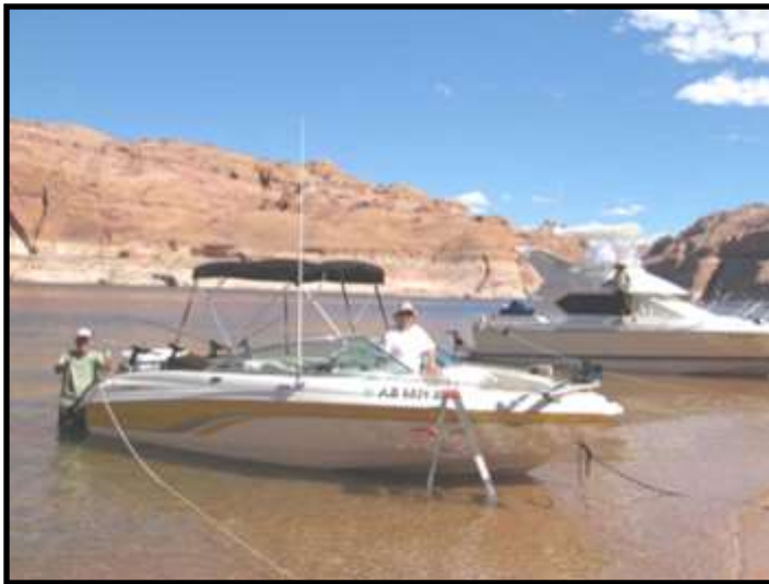
The Lake Powell Fleet—Another Adventure and Bella Rosa stop for a brief respite at a Lake Powell Beach. Lake Powell has a longer coast line than California.

The next day we all boarded the Bella Rosa for a quick trip to Antelope Point Marina for some fresh water and ice and ice cream cones. It was a nice day in the low 90's but you could see the clouds brewing as the remnants of hurricane Polo approached. We returned to camp as the wind started picking up. Near us were several other boats anchored bow out and stern tied to shore. This is not the best way to secure your boat at Lake Powell and certainly not advised when the weather gets dicey. Sure enough, one of the boats broke lose during the night and collided with another. It was a good thing that both boats involved were owned by the same person.