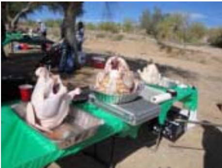
Awaiting their fate —These three birds gave their all for those attending the 9th annual turkey fry

If you have been waiting for the 9 th Annual Turkey Fry, you missed it. This year rivaled any of the past Turkey Fry's for location, attendance, menu, and weather.