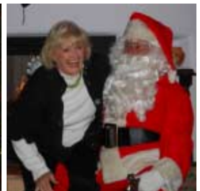
A visit from Santa— photos captured with Santa visited both good and bad little boys and girls at the Christmas Party.